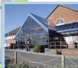
Ramsgate Road entrance