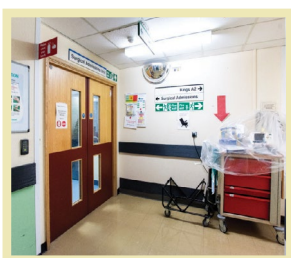
Surgical Admissions Lounge Entrance