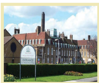
St Peter's Road entrance