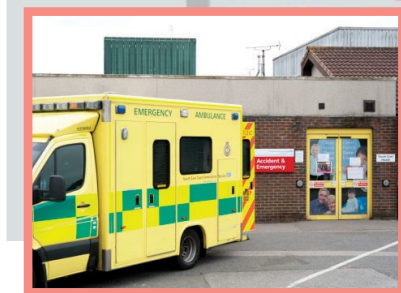
Emergency Department Entrance