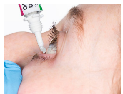
Using eye ointment