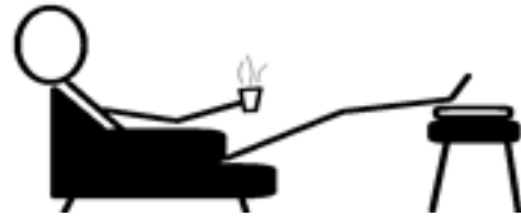
An example of good posture and elevation