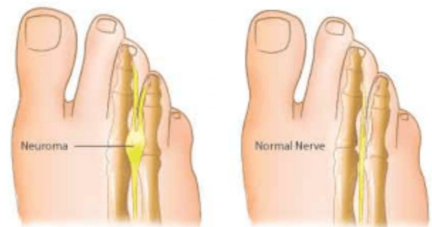
Comparison between a normal nerve and an inflamed nerve (neuroma)

Morton's Neuroma is an inflammation (swelling) and thickening of a nerve in your foot. It is found between the metatarsal bones, a group of five long bones in the foot (see diagram).