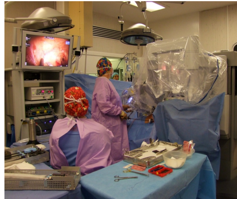
Da Vinci Robot