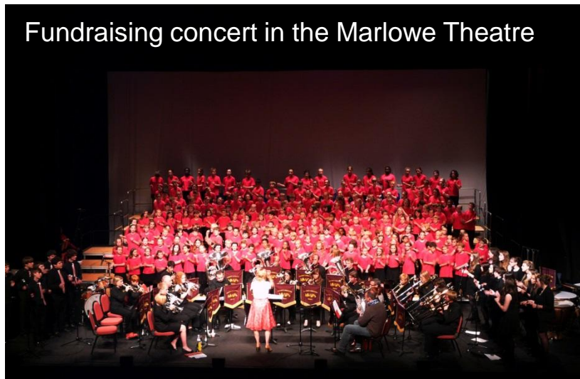
Fundraising concert in the Marlowe Theatre