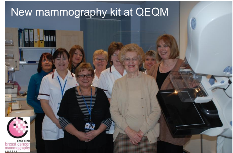
New mammography kit at QEQM