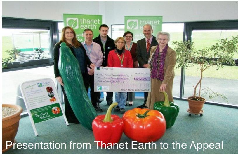
Presentation from Thanet Earth to the Appeal