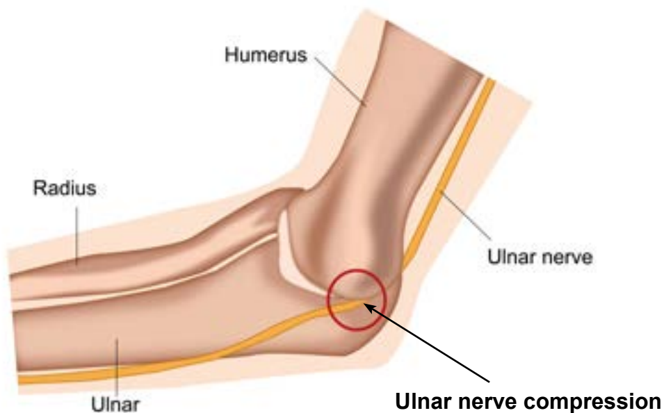
Diagram showing where the ulnar nerve can be compressed on the inside of the elbow

Cubital tunnel syndrome is when your ulnar nerve gets compressed (squeezed) or irritated within the tunnel found on the inside of your elbow (where your 'funny bone' is). This compression or irritation stops the nerve from working correctly.